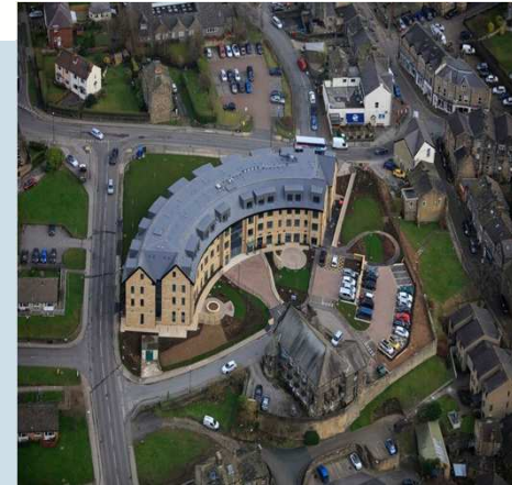
Front Ariel View