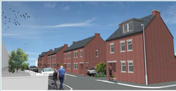
Indicative visual - Garnet Site