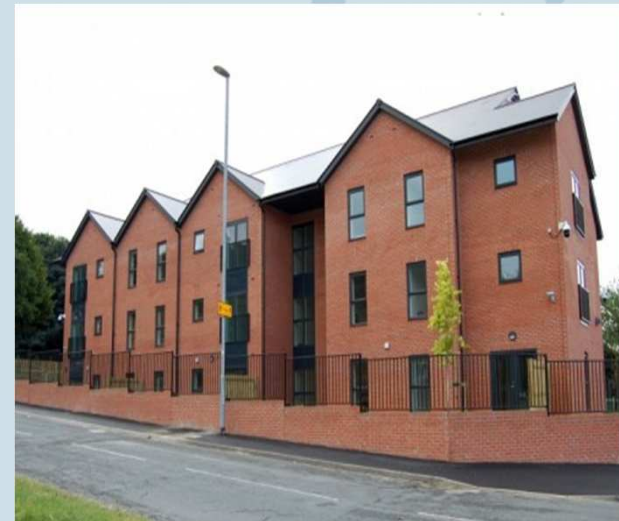
The Plantation, Swarcliffe