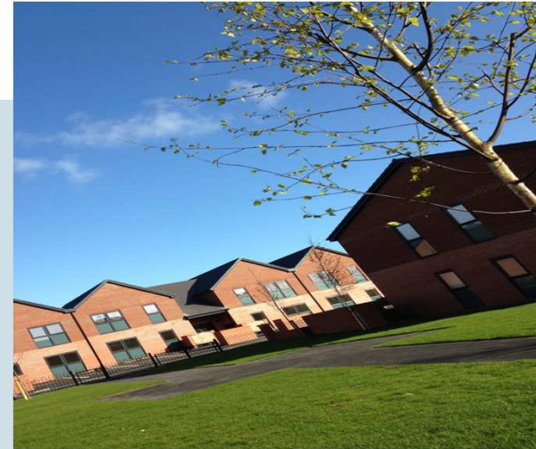
Railway Close, Richmond Hill