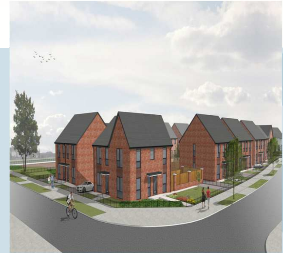
Indicative street scene for Whinmoor