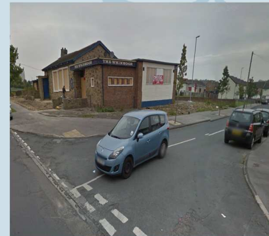
Former Whinmoor Pub