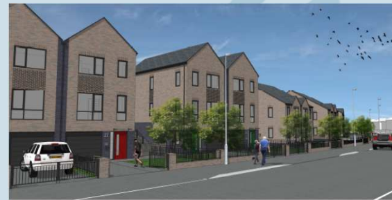
Indicative visual – Broadleas site