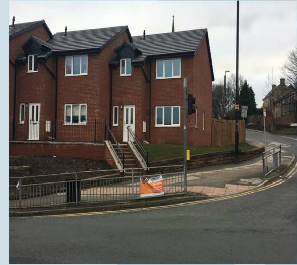
Houses at Cardigan Green, Bramley