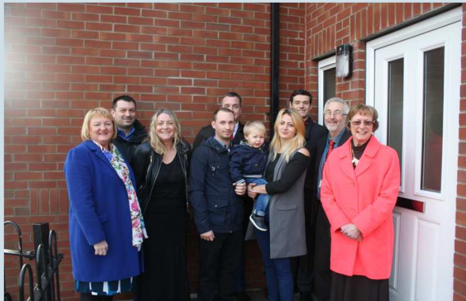
Councillors and RDF meeting the new tenants in January